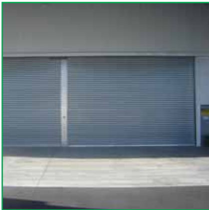
Centre Sliding Mullion - Doors Down