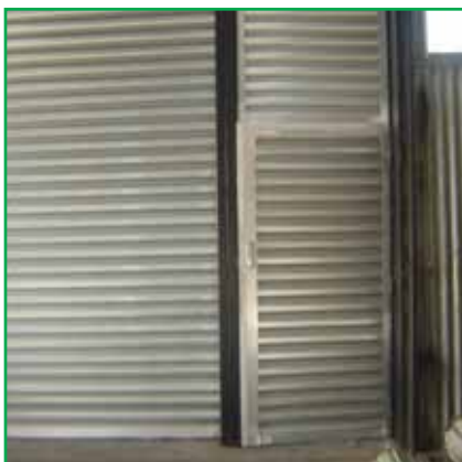
Side Wicket Gate