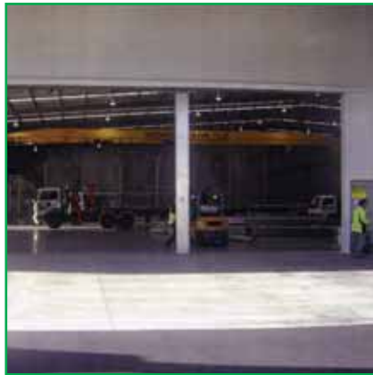
Centre Sliding Mullion - Doors Up